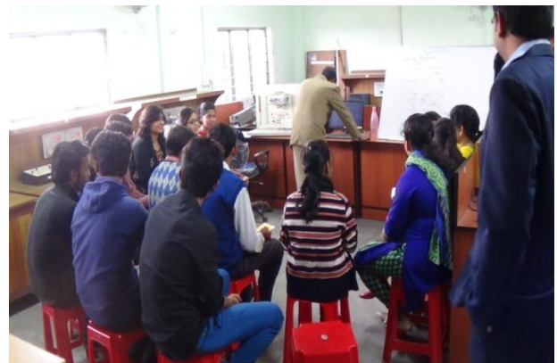
Figure6: Hands on Session with the PLC hardware set up.