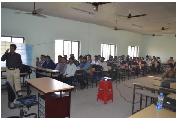
Figure5: Session of HOD Sir, Dept. of AEIE, RCCIIT