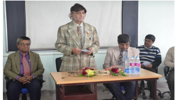
Figure2: Inaugural Speech of Respected Chairman Sir, RCCIIT