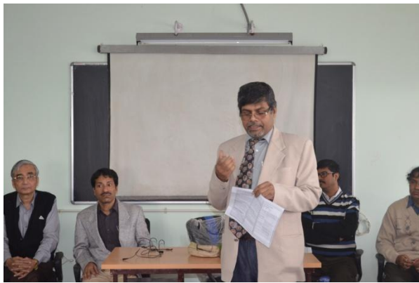
Figure3: Inaugural Speech of Respected Principal Sir, RCCIIT