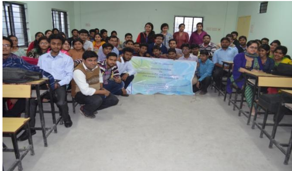
Figure1: Group photographs of Students.

Here are some of the pictures of the said workshop: